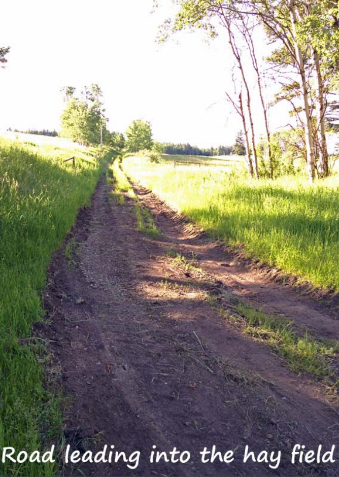
Road leading into the hay field